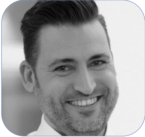
Head of Agile Transformation NTT DATA DACH